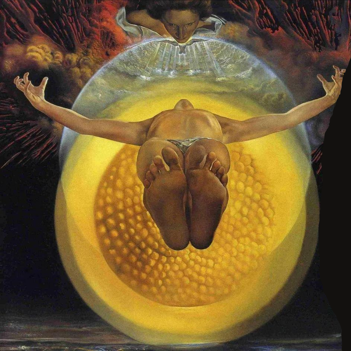
"The Ascension of Christ" S Dalí