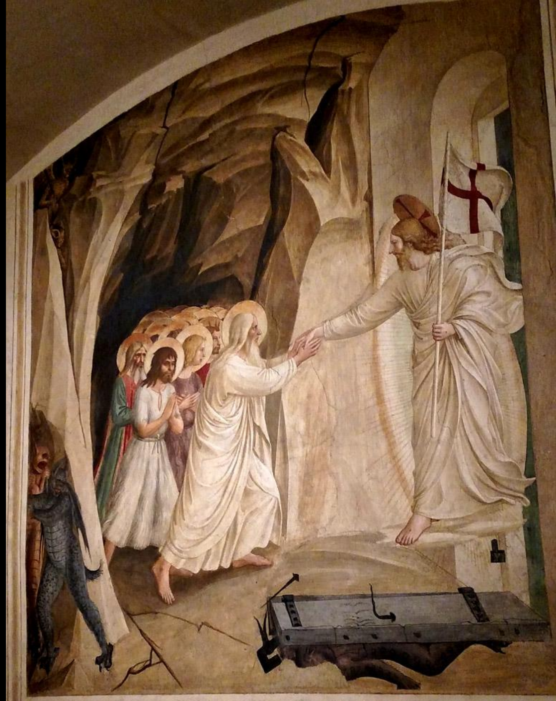
School of Fra Angelico The Anastasis (Harrowing of Hell)