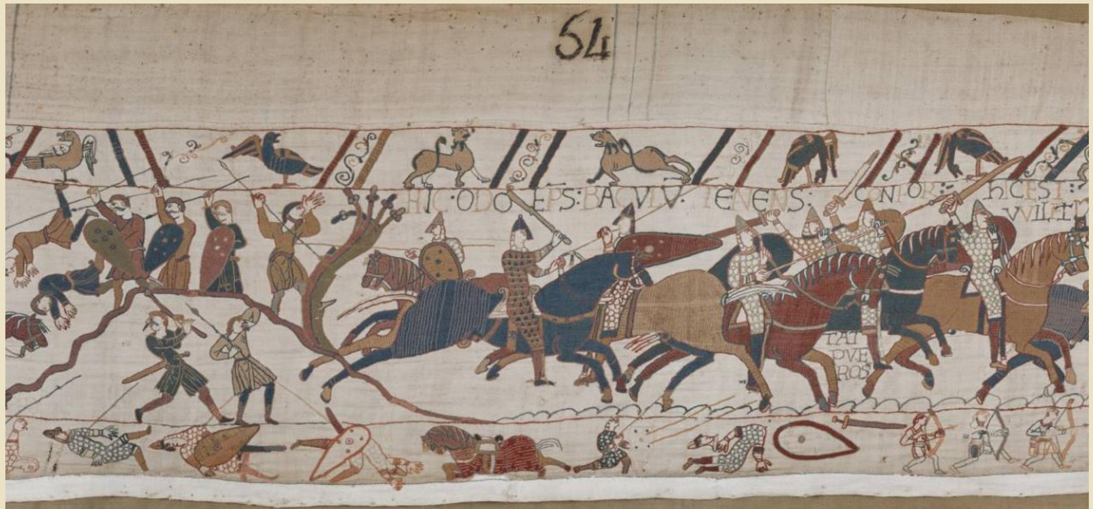
Bishop Odo holding a spear comforts the young men